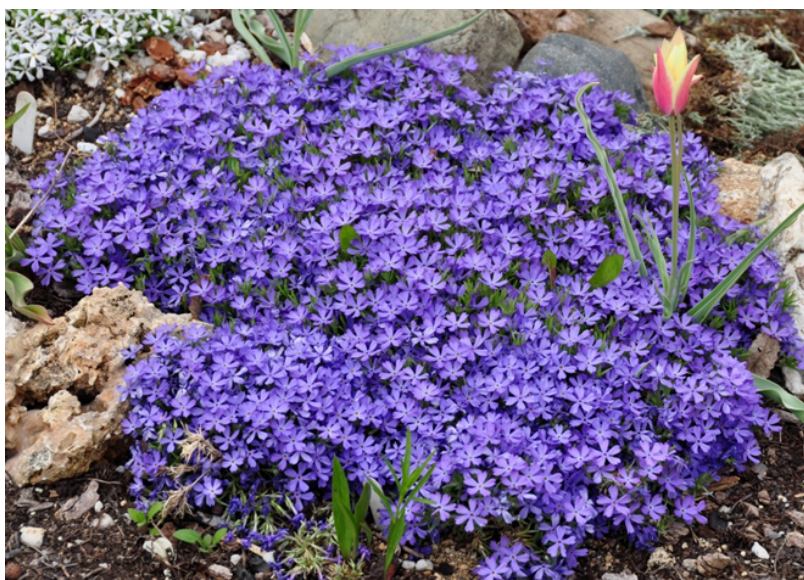
Figure 10. Phlox 'Violet Pinwheels' PP# 25,884.

This delightful hybrid phlox breaks new ground in the spring blooming moss phlox genre. The notched, upturned petals truly look like they could take flight with a good breeze, hence the "violet pinwheels" cultivar name (Figure 10). The ¾ inch-wide flowers open a vivid purple color and age to a still vivid violet color, rare colors among the moss Phlox. We have observed 5 weeks of bloom commencing as early as late March and extending as late as mid-May, spring temperatures depending, in northern Illinois (USDA Zone 5). The plants consist of low, slowly spreading mounds of dark green needle-like foliage that is soft to the touch. Three-year-old plants have grown to 18 in. wide × 4 in. tall and have been evergreen year around. This plant is a perfect marriage of eastern and western phlox, combining unique beauty with adaptability to heat, cold, alkaline and saline soils. It is best grown in full sun on well drained soils and with an adequate water supply. 'Violet Pinwheels' is readily propagated by shoot tip cuttings taken from new growth in spring or autumn. This plant was developed by Jim Ault at Chicago Botanic Garden from a cross made in 2008 between P. bifida and P. kelseyi 'Lemhi Purple'. USDA Zones 4-8. A Chicagoland Grows® Inc., plant introduction.