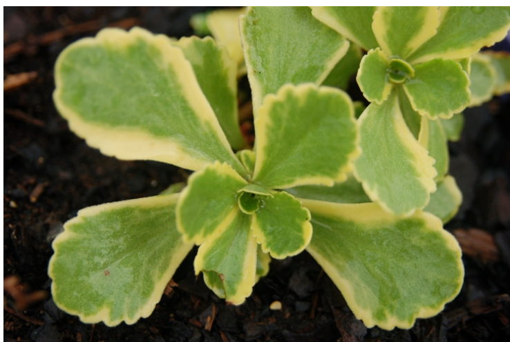
Figure 11. Sedum ellacombianum 'Cutting Edge' PPAF.

Yellow edged, bright green foliage on mounding plants look good from spring to fall providing a bright contrasting plant for full sun to part shade (Figure 11). Well drained soil.