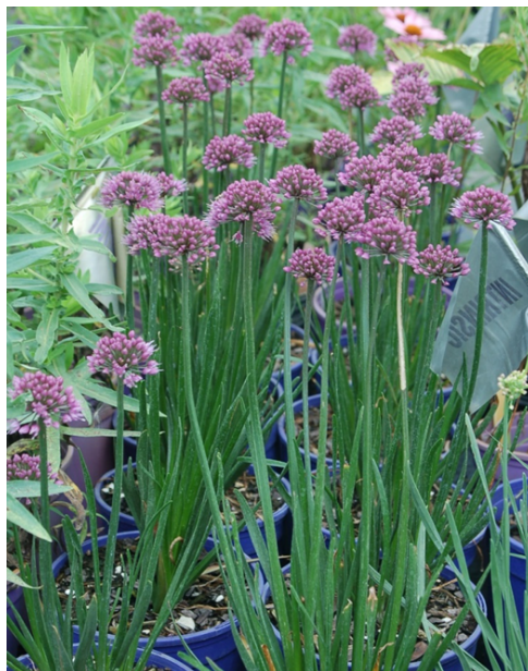
Figure 2. Allium 'Windy City' PPAF.