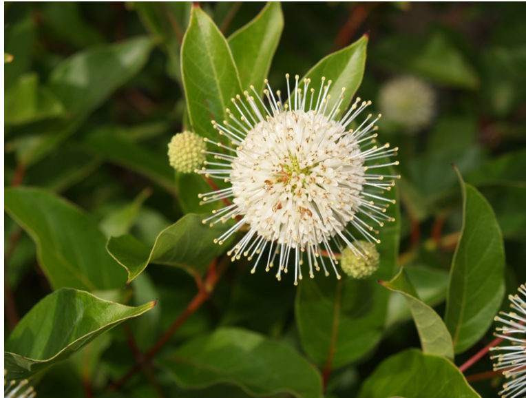
Figure 3. Cephalanthus occidentalis Magical® 'Moonlight' buttonbush.

Cephalanthus occidentalis or buttonbush is a native shrub growing naturally in bogs or in moist areas to a height and width of 6-10 ft. Magical® 'Moonlight' buttonbush is a distinctive, compact form with slightly smaller glossy leaves and a mounding habit to about 5 ft height and wide (Figure 3). The distinctive globular white flowers appear in mid summer and are hummingbird and butterfly magnets. A perfect choice for the rain garden or bioswale yet readily adapts as an ornamental shrub in average garden soils.