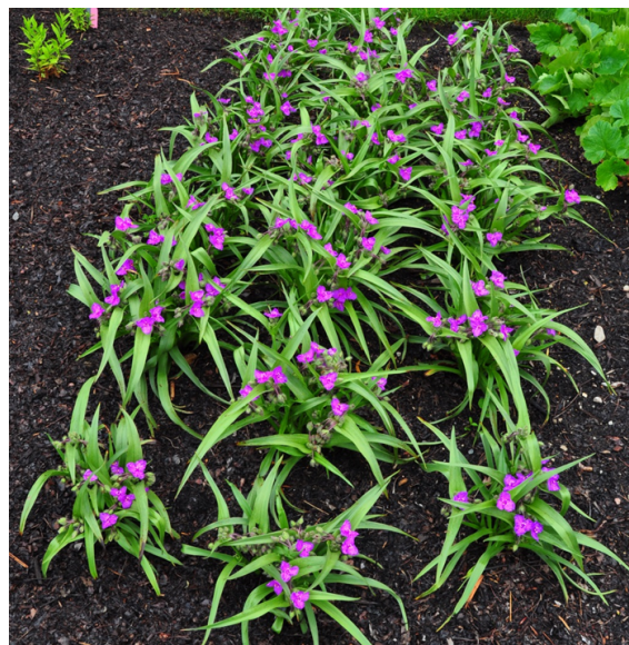
Figure 14. Tradescantia 'Tough Love' PP# 25,988.

A new direction in spiderwort breeding! Most of the hybrid spiderworts in the