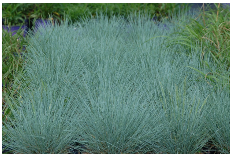
Figure 4. Festuca 'Cool as Ice' PPAF.