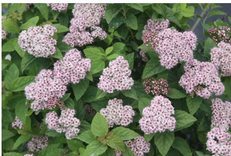
Figure 12. Spiraea fritschiana 'J.N. Select A', Pink-a-licious™ Fritsch spirea.