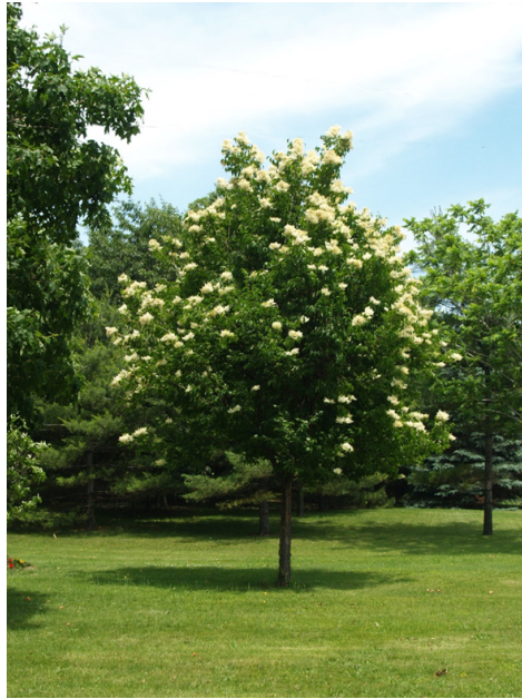
Figure 13. Syringa reticulata subsp. pekinensis , 'WFH2', Great Wall™ Peking tree lilac.

This is a distinctive Peking lilac with an upright form, ascending branches and cherry-like exfoliating bark and crisp, dark green foliage maturing into a 15-20 ft small tree (Figure 13). Clusters of pure white flowers emerge about 10 days earlier than S. reticulata . The distinctive form makes it an ideal choice for use as a street tree. It easily develops a central leader and is a vigorous grower making up quickly to a saleable plant. It is recommended to plant field liners from potted liners rather than bare root. Licensed growers can easily propagate the tree by budding or grafting.