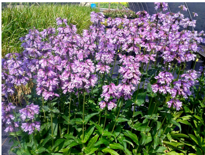
Figure 8. Penstemon calycosus .

Penstemon calycosus is an herbaceous 2-3 ft perennial native to the eastern USA. The plant is very adaptable as a garden plant performing far better in eastern gardens than the western natives. It grows well in light shade to full sun in moist but well drained to dry soils. Flowering in late spring to early summer (Figure 8). Flowers can range in color from light violet to purple and are produced on terminal panicles against a background of glossy green lance-shaped leaves. The clone we have chosen has dark bluish-purple flowers. The plant is easily propagated by division or softwood cuttings.