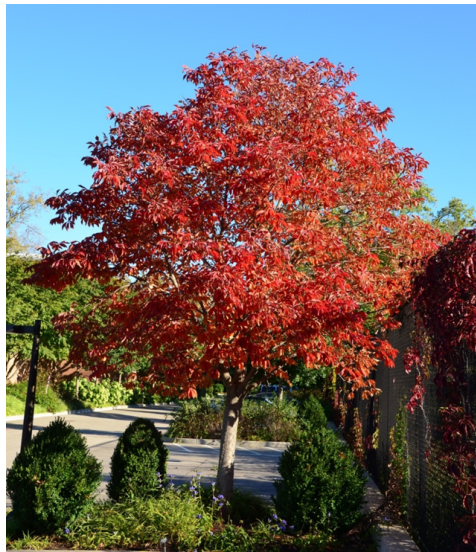
Figure 1. Aesculus glabra 'J.N. Select', Early Glow™ Ohio buckeye.

Early Glow™ buckeye is a seedling selection found by Michael Yanny in 1981 (Figure 1). The original tree, at about 30 years old, is approximately 30 ft tall × 20 ft wide. Early Glow™ buckeye gets its name from its bright red fall color in mid to late September in Southern Wisconsin. It is typically the first tree to get fall color each year at Johnson's Nursery. Its form and growth rate seem to be similar to A. glabra seedlings, though it does show better late season foliage quality than straight species plants. Early Glow™ buckeye produces very few seeds giving it great potential as a street tree. It seems the reason for the near seedless nature of the tree is that fewer pistils elongate enough to be easily pollinated.