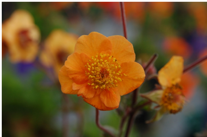
Figure 5. Geum 'Citronge' PPAF.

Creamy orange flowers emerge in May from red stem and buds on 18 in. stems (Figure 5). Wide folded petals overlap giving a nice full effect. Heavy blooming plants have some rebloom too. Full sun, moist rich soil. Zone 4-8.