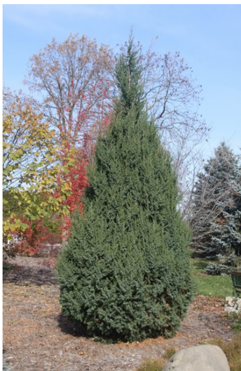
Figure 6. Juniperus chinensis 'J.N. Select Blue', Star Power™ Chinese juniper.