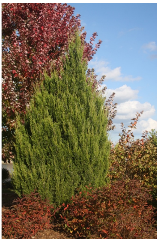
Figure 7. Juniperus virginiana 'J.N. Select Green', Emerald Feather™ eastern redcedar.